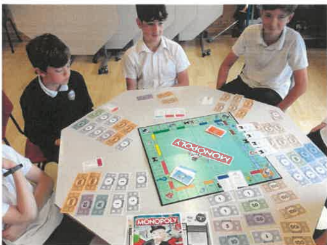
Managing money, Class 3