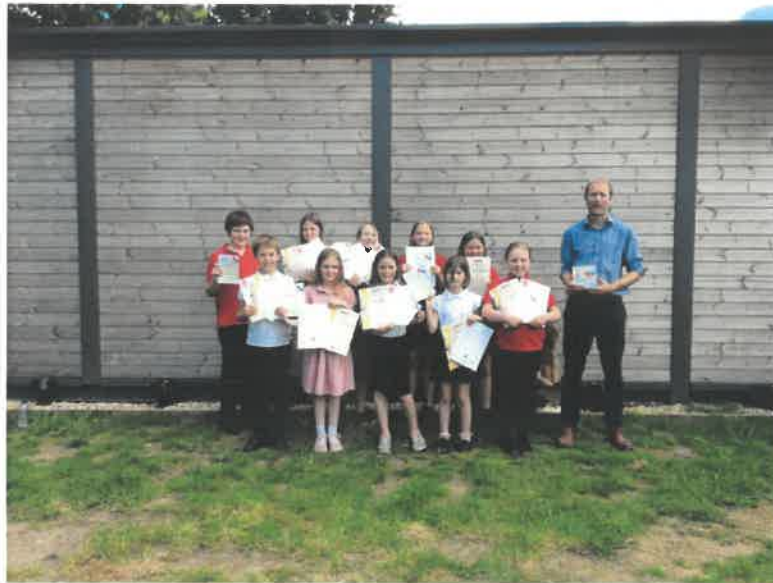
Finance school