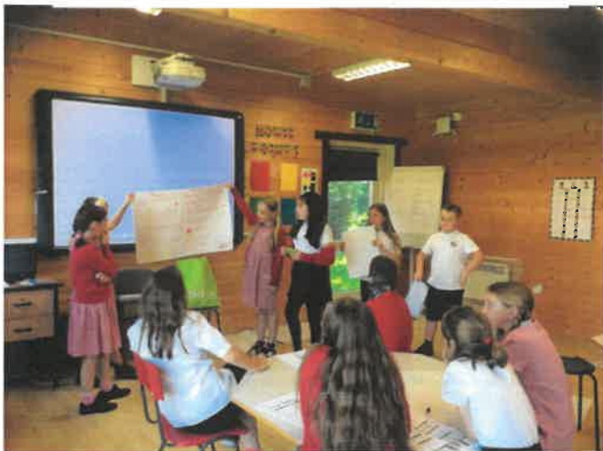
Finance school