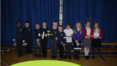
The Nebula Flying Competition