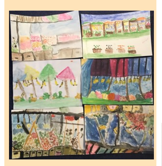
Year 6 water colour artwork of the Trinidadian market from the book 'Coming to England' by Floella Benjamin. WWL