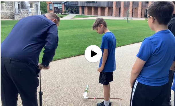
STEAM Activities at Greshams: Launching our rocket!

Congratulations to our year 6 team who travelled to Gresham's yesterday to take part in a science enrichment activity afternoon. They programmed rockets and constructed rockets which were then successfully launched. Great work!