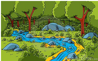
Project borrowed from Robin Hood MAT

* Geography: Forest Floor: Collect and use natural materials to create your own forest floor