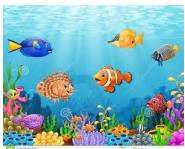
Project borrowed from Robin Hood MAT